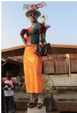
Ngadi Smart, The Faces of Abissa, 2016 © Ngadi Smart

Demachi Masugata Shopping Arcade DELTA/KYOTOGRAPHIE Permanent Space