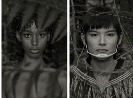
[L] Erwin Olaf, Im Wald, Porträt XII, 2020 [R] Erwin Olaf, Im Wald, Porträt VII, 2020

The Museum of Kyoto Annex Co-organizer: Kyoto Prefecture