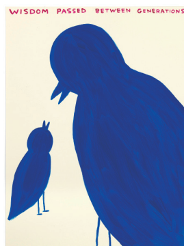
David Shrigley, untitled, 2019

David Shrigley is a British artist whose rudimentary but unmistakable line is used to observe his surroundings with incomparable irony, often accompanied by an absurd and irreverent sentence to challenge us and get our attention. Humour—be it naive or noir—is his instrument of choice and wielded with great precision. While drawing is at the center of his practice, the artist also works across an extensive range of media including sculpture, large-scale installation, animation, painting, photography and music.