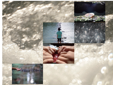
RongRong&inri, from the series of Jifei Kyoto, 2015–2021

Chinese photographic art pioneer RongRong (born in 1968) and Japanese photographer inri (born in 1973) teamed up in Beijing in 2000 as "RongRong&inri," and have since played a leading role in photographic expression in China. In 2007, the pair established China's first contemporary photography center, "Three Shadows Photography Art Centre," in Caochangdi in Beijing. With the aim of becoming a platform for the discovery, dissemination, and development of contemporary photographic art in China, the center holds a variety of exhibitions and programs throughout the year.